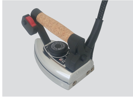
FER À REPASSER PROFESSIONNEL PROFESSIONAL IRON